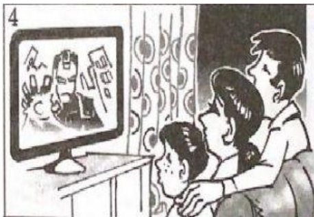
Homework, home, family, television