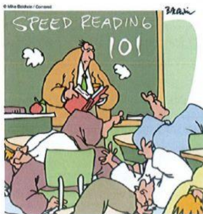
Am I going too fast for you?

7 Read the instructions for Questions 7–13 and the title of the table. Which three paragraphs do you need to read carefully to complete the table?