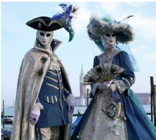
The Carnival in Venice, Italy

At the Venice carnival, some people wear long dresses or cloaks. They want to have fun, but they don't want to be cold. The day after the carnival, Christians start the time of Lent.