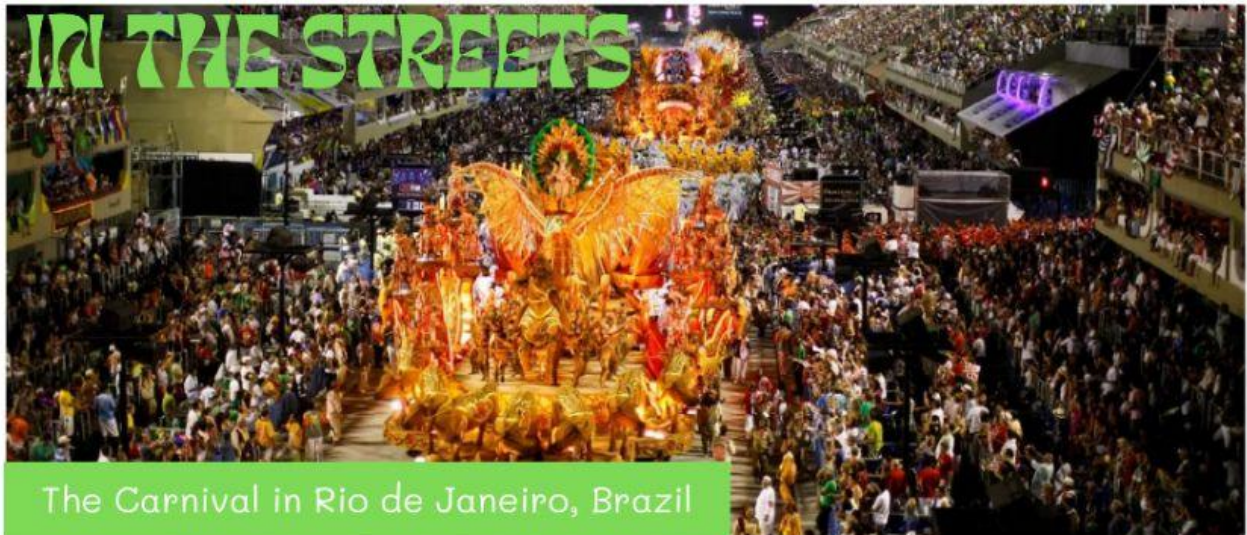
The Carnival in Rio de Janeiro, Brazil

Come to the carnival! The carnival in Rio de Janeiro in Brazil is one of the biggest festivals in the world. It's always in February or March. There's a parade with big floats. There's music in the streets. People wear colorful costumes. They dance and have fun.