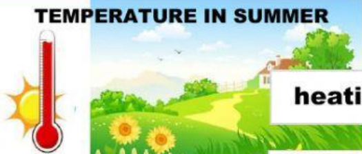
TEMPERATURE IN SUMMER