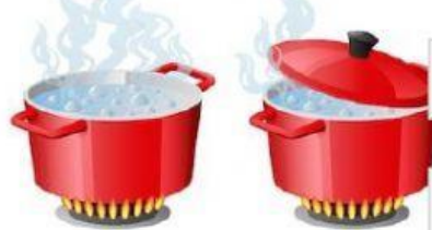
PANS TO THE HEAT