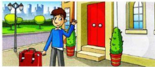
Uncle Charlie's new apartment

Question 1: Listen and write. There is one example.