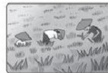
a rice field