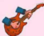
play the guitar