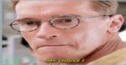
ตัวเลือกอันคับคั่ง ๆ ของฉัน