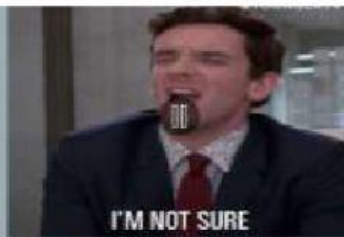
I'M NOT SURE