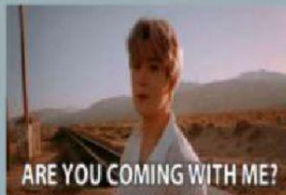
ARE YOU COMING WITH ME?