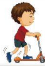
Riding a scooter