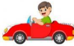
Driving a car