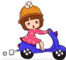
Riding a motorbike