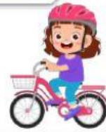
Riding a bike