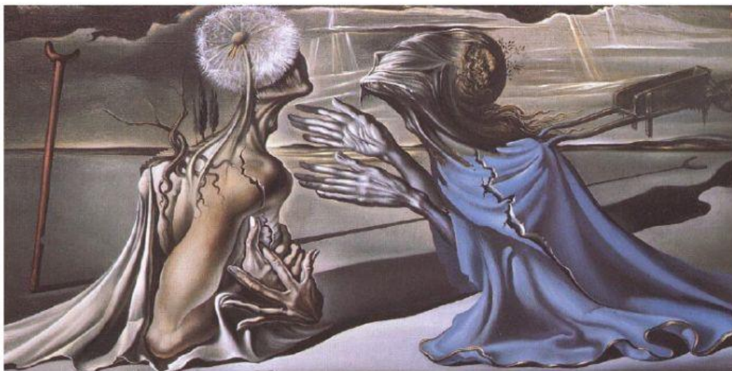
Tristan and Isolde 1944, by Salvador Dali