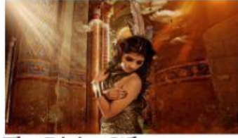
The Divine Whore