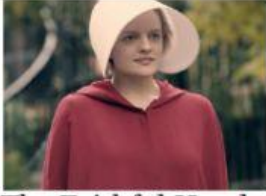
The Faithful Handmaiden