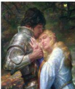
Lancelot and Guinevere

Archetypes form the basis of all unlearned, instinctive patterns of behavior. These powerful universal symbols exist in what pioneering psychologist Carl Jung referred to as the "collective unconscious". A reservoir of human experience, the collective unconscious looms over the individual psyche like a shadow, quietly influencing our actions and reactions.