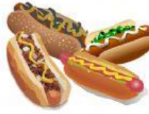
Hot - dogs