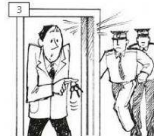
3 go through security