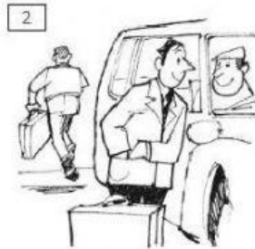
2 pay the taxi driver