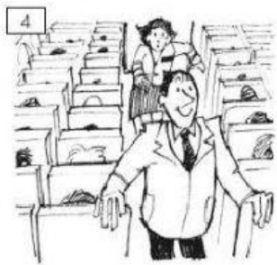
4 go for a walk