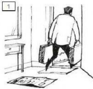
1 drop his ticket

Direction: Look at the pictures and the actions that Tim Bobo performed. Complete the paragraph by using the simple past tense or the past continuous.