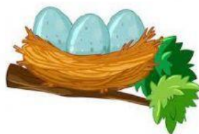
Eggs in a nest