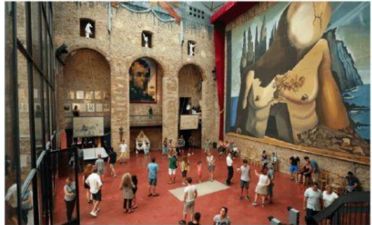
Tumba de Dalí in his own Museum.

Dalí was a very important multi-faceted Spanish artist.