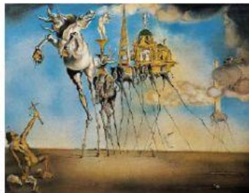
"La tentación de San Antonio"