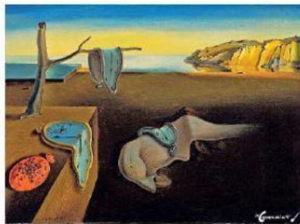
"La persistencia de la memoria"