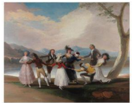
"La gallinita ciega"