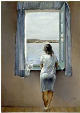
"Muchacha en la ventana"

8. Click on all his pictures. (It is possible to select more than one)