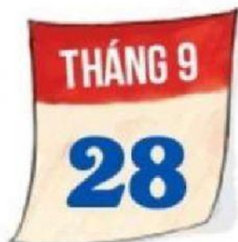
Unit 4 - 9