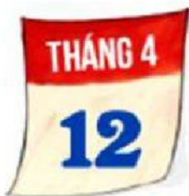
Unit 4 - 3