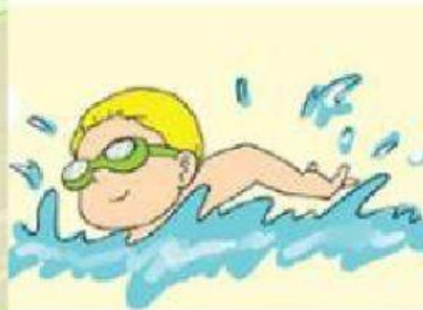
Unit 5 - 4