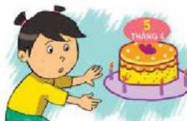
Unit 4 - 10