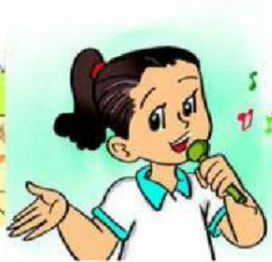
Unit 5 - 6