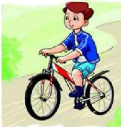
Unit 5 - 3