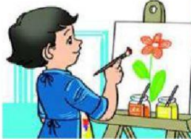
Unit 5 - 1