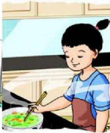
Unit 5 - 2