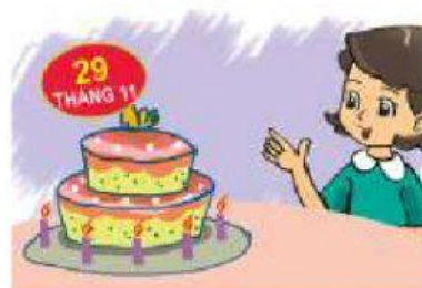
Unit 4 - 12