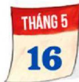
Unit 4 - 4