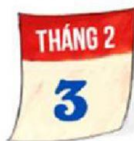
Unit 4 - 2