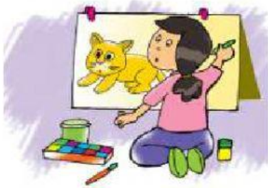
Unit 5 - 7