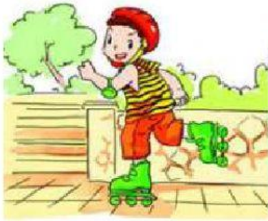
Unit 5 - 5