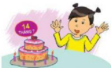
Unit 4 - 11