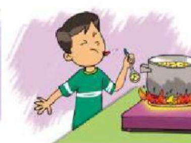
Unit 5 - 8