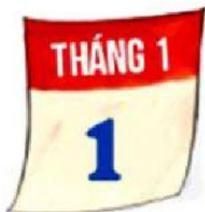
Unit 4 - 1