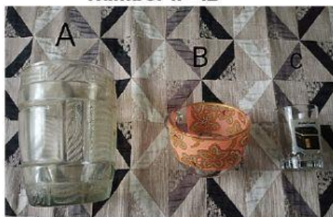
Number 11 - 12

There are 3 cups. C cup is _____ (small), B cup is the most standard and A cup is _____ (big).