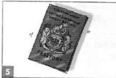
5 passport / public transport