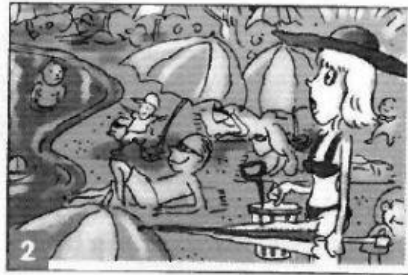
2 crowded / nearby