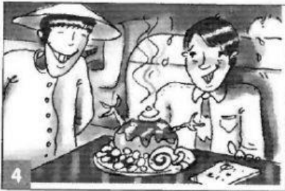
4 convenient / foreign