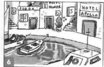
6 resort / trip

C Complete using the correct form of the verbs in the box.