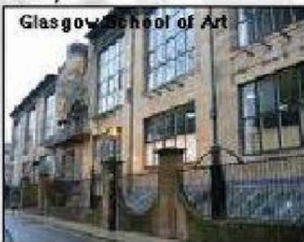
Glasgow School of Art

He used simplified linear roses, and straightened plant forms, mixed with geometric shapes such as squares and rectangles, in the design of the building. Mackintosh also designed the interiors and furniture. Mackintosh never designed jewellery in the Art Nouveau style - but many of his ideas have been copied or redesigned as modern jewellery pieces.