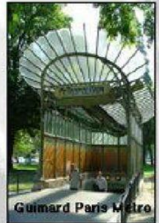
Guimard Paris Metro

Designers such as Rene Lalique and Émile Gallé in France produced glass and jewellery . Louis Comfort Tiffany in New York designed stained glass lamps - still reproduced today.