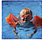
swim (past simple: swam)