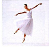
dance (past simple: danced)