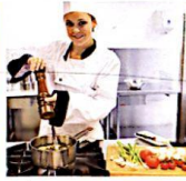
cook (past simple: cooked)