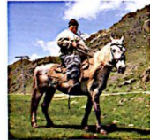
ride a horse