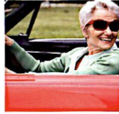
drive a car (past simple: drove)