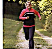
run (past simple: ran)