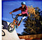
ride a bike (past simple: rode)