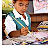
paint (past simple: painted)