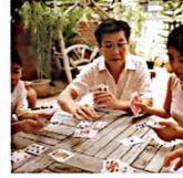
play cards (past simple: played)