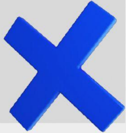
Table del 1