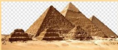
PYRAMIDS OF GIZA