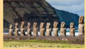
EASTER ISLAND MOAI STATUES