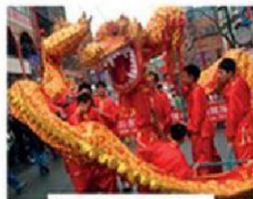
Lunar New Year