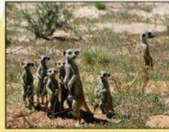
A group of meerkats in the wild

Write the main idea of the paragraph in your own words.