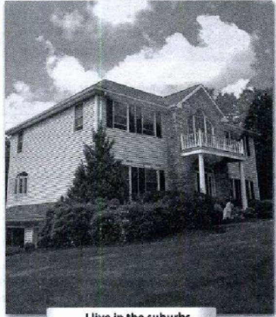
I live in the suburbs.

B Correct the false statements in part A.