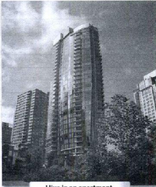
I live in an apartment.