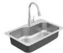
2. s ____