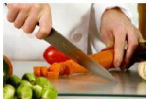
1. c ____ u ____