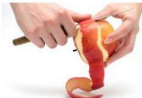
4. p ____ l