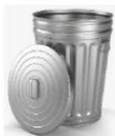
3. t ____ c ____