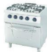
5. s ____