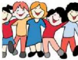
1. New friends