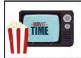
4. Watch movies