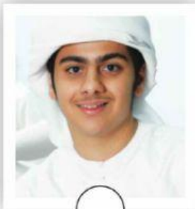
1 The United Arab Emirates

You're going to talk about colors. Every culture connects colors to a meaning. For example, the color red means to be brave in Emirati culture. But in China, the color orange is a brave color. Get into your groups and find what colors mean to the world!