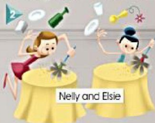
Nelly and Elsie