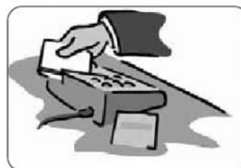
Using a debit card