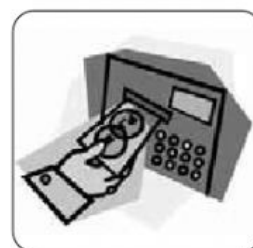
A debit card