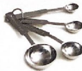
▲ measuring spoons

Beakers, measuring cylinders and measuring cups can be used to measure