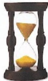
▲ egg timer

Watches and timers can be used to measure