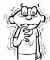
bravest: not scared as much

Some boys were playing one day by a pond . A family of frogs lived in the pond. The boys were having fun. They threw stones into the pond. They made the stones skip on top of the water .