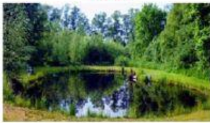
the stones skip on top of the water