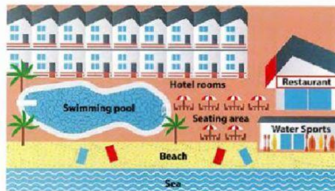
Beach hotel 2013