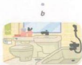
He's in the bathroom.