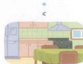
He's in the kitchen.