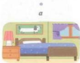
She's in the bedroom.