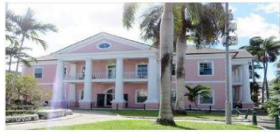
Supreme Court Building, Nassau

SECTION A: Fill in the blank. Select the correct word from the box and write it on the line to match each definition clue. (1 point each).