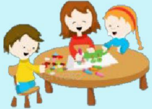
I and my friends