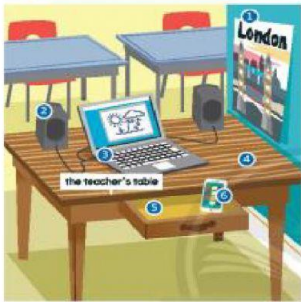
table drawer mobile phone poster laptop speaker desk coat bag chair notebook pen shelf board dictionaries clock