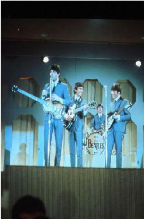
The Beatles, as young musicians in the 1960s