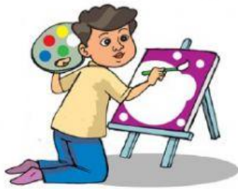
Unit 9 - 7