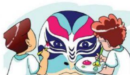
Unit 9 - 6