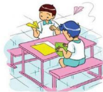
Unit 9 - 4