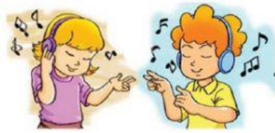
Unit 9 - 1