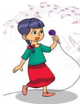
Unit 9 - 12