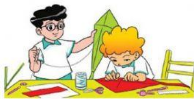
Unit 9 - 3