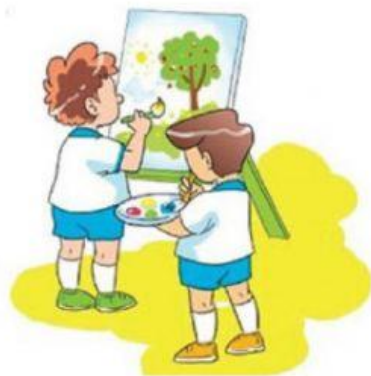
Unit 9 - 5