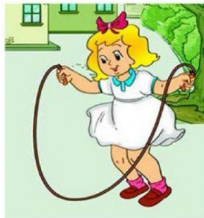
Unit 9 - 10