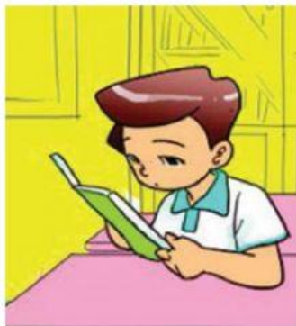
Unit 9 - 11