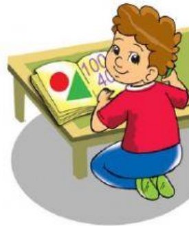
Unit 9 - 8