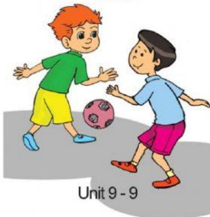
Unit 9 - 9