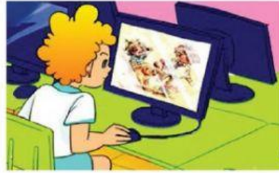
Unit 9 - 2