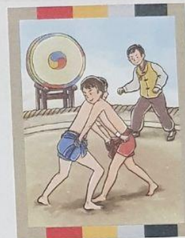
ssireum – Korean wrestling