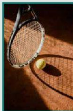
tennis racket and ball

About a year ago, I also started playing badminton. It's a very interesting game. Like tennis, you can play it indoors or outdoors. Like tennis, it's a game for two people or four people. And like tennis, you have a racket, and there's a net. But one thing is very different. In badminton, you hit a shuttlecock, not a ball.