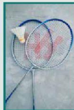
badminton rackets and shuttlecock