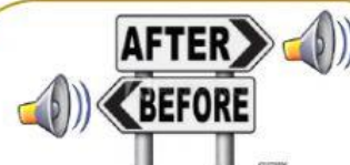
TELLING THE TIME