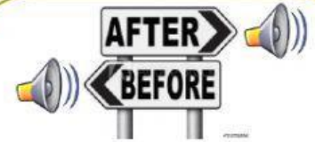
TELLING THE TIME