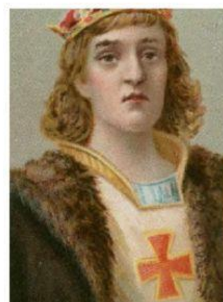
Edwig the Fair

King of 3 countries Very promiscuous 18 when crowned He was seen most like a monk than as a king 38 when crowned Exiled Saint Dunstan Assassinated during a feast 15 when crowned