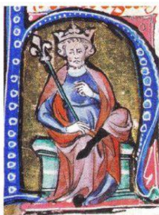
Canute the Danish Viking

Drag the statement to the correct monarch.