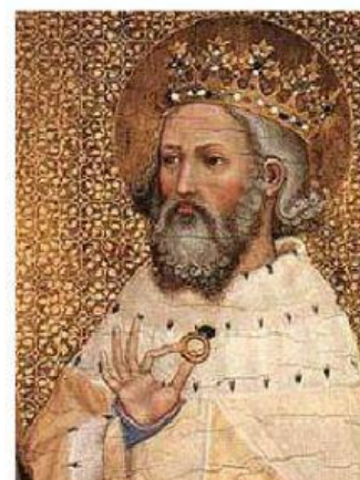
Edward the Confessor

Divided England in 4 Earldoms His widow became a nun Also known as "The Elder" 4 years of disastrous reign Murdered at 19. 24 when crowned