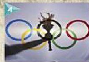
Olympic Games / World Cup