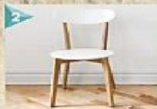
chair / sofa