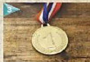
medal / trophy