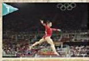
gymnast / dancer