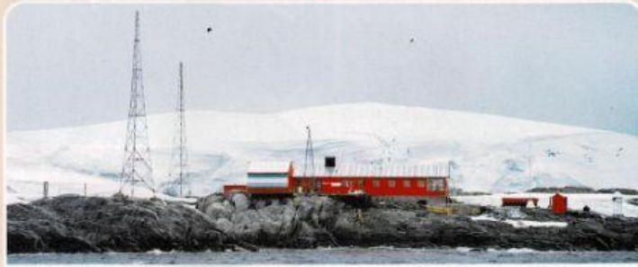
Scientists in Antarctica live and work in buildings like these.

The continent with the fewest people is Antarctica. The only people who live there are scientists. They are there to study the world's coldest continent.