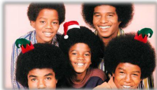
Cover by The Jackson Five