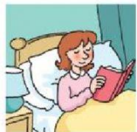
go to bed