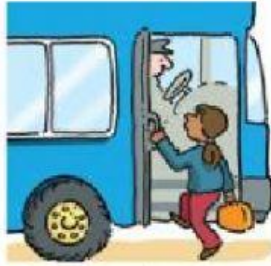
go to school