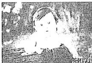
lovely / baby