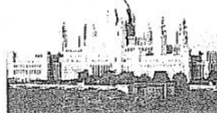
magnificent / palace