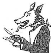
hungry / wolf