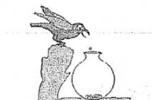
smart / crow