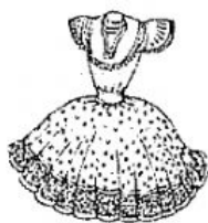
beautiful / dress