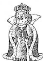
good-hearted / queen