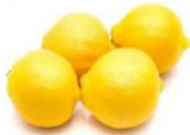
Four lemons or limes