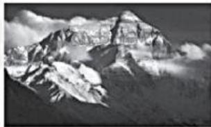
Everest, Nepal _____ metres.