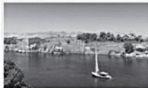
River Nile, Egypt _____ Kilometres.