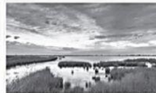
River Ebro, Spain _____ Kilometres.

5. Look at the chart and write the numbers in lyrics: (Mire la tabla y escribe los números en letras)