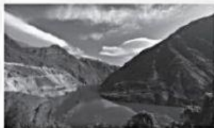
River Yangtze, China _____ Kilometres.