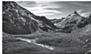
Aneto, Spain _____ metres.