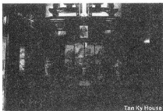
Tan Ky House

One of the main (6) _____ of Hoi An is the Japanese Bridge, which was built in the 16 th century and is still well-preserved. All visitors to Hoi An are recommended a visit to the Assembly Hall of Cantonese Chinese Congregation. This house was built in 1855 and still keeps many precious (7) _____ that belonged to the Chinese (8) _____ of Hoi An. Another attractive address to tourists is Tan Ky House, which was constructed nearly two centuries ago as a house for a Vietnamese (9) _____. The house now looks almost exactly as it did in the early 19 th century.